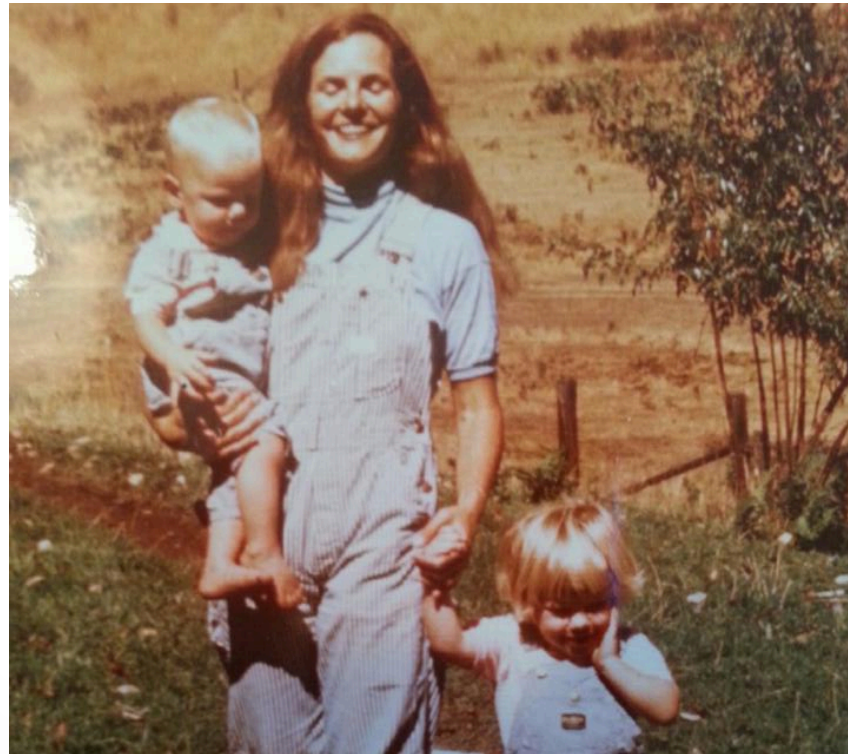
This is a picture of my mom, my sister and me in Mendocino County

There are four people in my family of origin: my parents, my younger sister, and me. I have a six year old daughter and a dog.