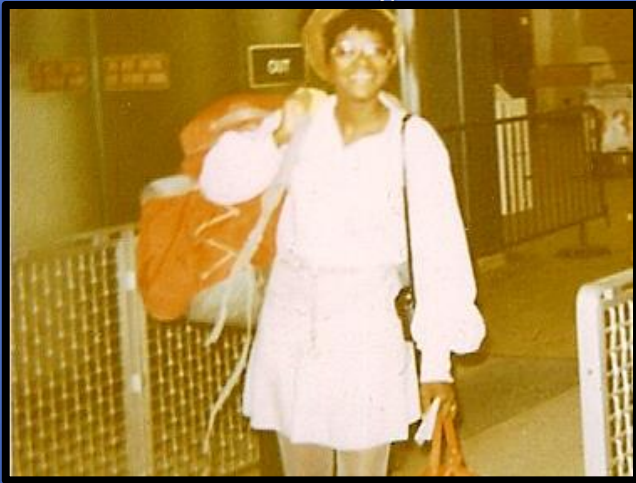
Off to Japan (my graduation gift)