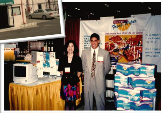
Early Trade Show Days