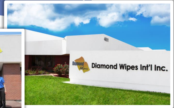
Present Day - Chino, CA Headquarters